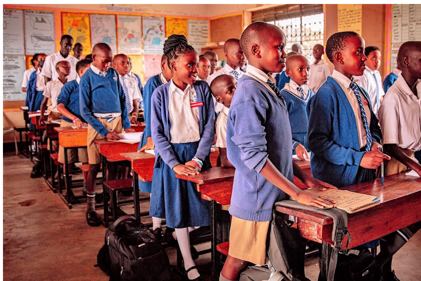
God Cares Primary Students Greet the Team