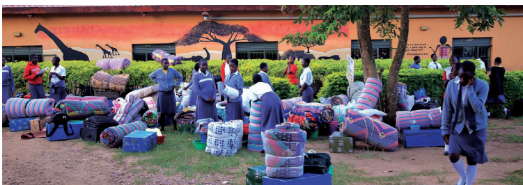
Getting ready to go home for term break

Some students may have to actually work during the term break, depending on their age and their family's financial needs, to help care for their family. Many will help at least with domestic chores at home and attend church activities in their village. The highlight for many of the high school students was attending the annual church youth camp put on by a ministry team called Reaction Tour. The theme was WORLD CHANGERS and it certainly impacted over 500 youths for the Lord.