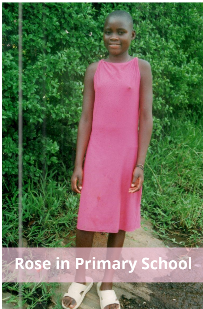
Rose in Primary School

If you have a sponsored student at either of these pivotal stages, our office will contact you to update you on their progress and decisions and how you can continue to support and pray for them.