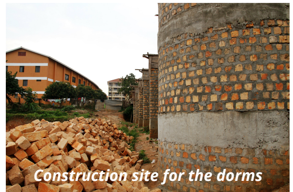
Construction site for the dorms